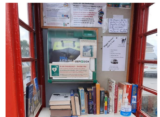
Defibrillator in Carnon Downs phonebox on Forth Coth

A big thank you to the fundraisers who raised enough money to install the new defibrillator at the Punchbowl, they have very kindly donated this to the Parish Council who have taken on the responsibility for its maintenance.