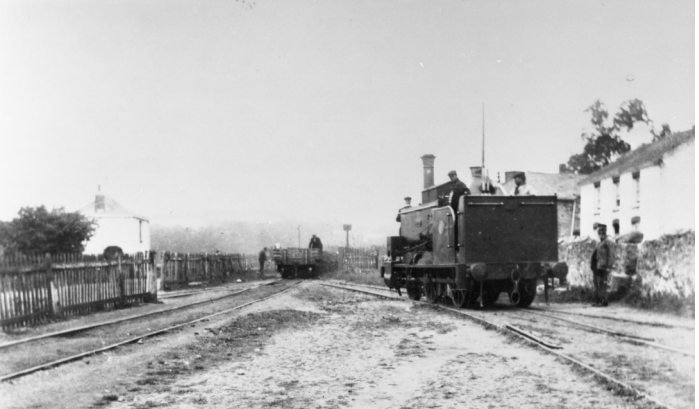
Brian Osborne's 'Images of the Past' collection #1429