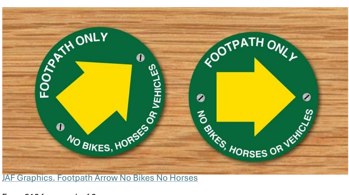
JAF Graphics. Footpath Arrow No Bikes No Horses