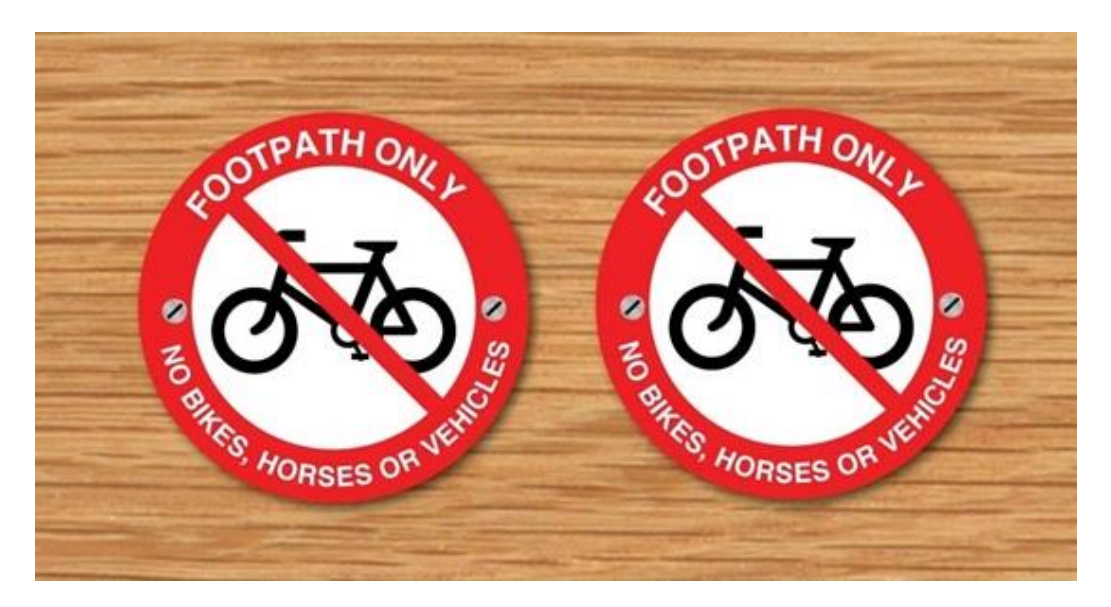
JAF Graphics. No Bikes Footpath Only Signs - Pack of 2 From £12 for a pack of 2